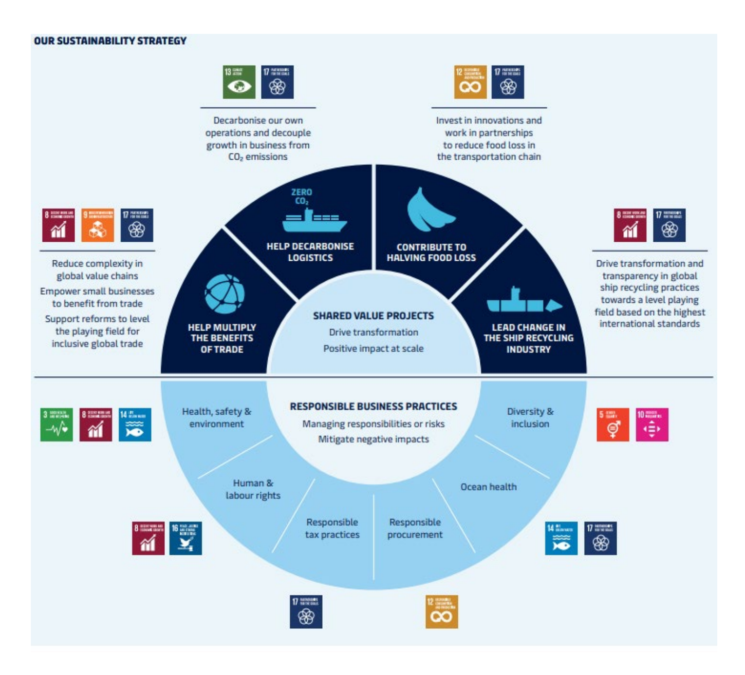
FIGURE 3: INFOGRAPHIC FROM A.P. MØLLER – MÆRSK'S REPORT DISCLOSING HOW THE SDGS CORRESPOND WITH THE COMPANY'S BUSINESS STRATEGY<sup>3</sup>